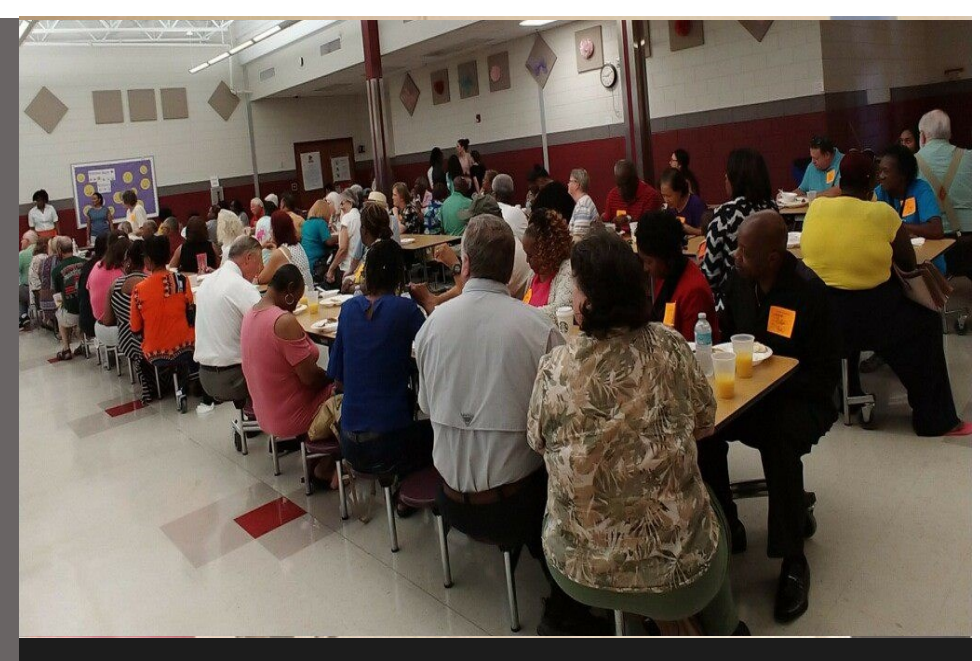
Parents receiving valuable information at a school's parent night

Additionally, the Title I department will provide training to principals so principals will understand parent and family engagement requirements and plan opportunities for family engagement activities and meetings for the remainder of the school year.